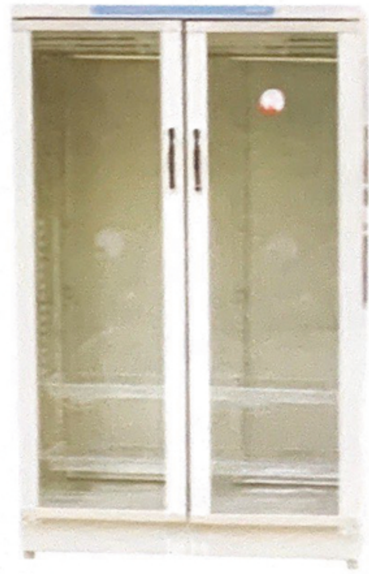
消毒柜 Disinfect cabinet