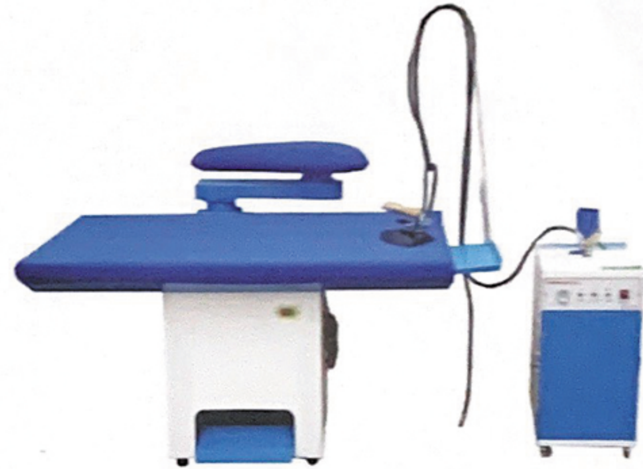
烫台、全蒸汽熨斗、蒸汽发生器 Ironing table/steam ironer /steam generator