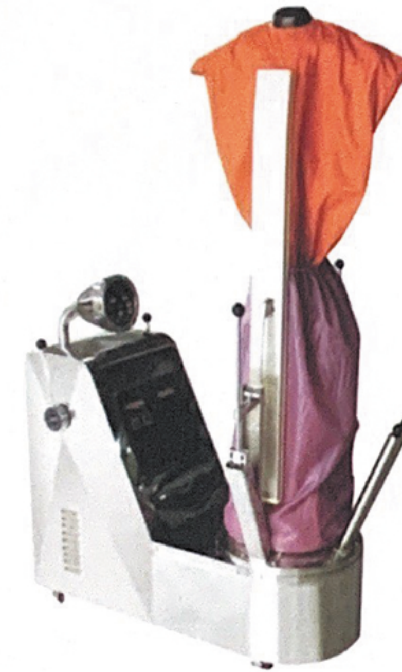
ZRT-10型人像熨烫机 ZRT-10 Automatic garment finisher