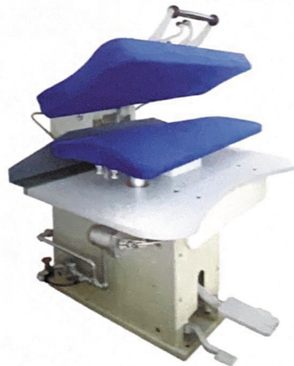
WJT-125型万用夹烫机 WJT-125 Universal press machine