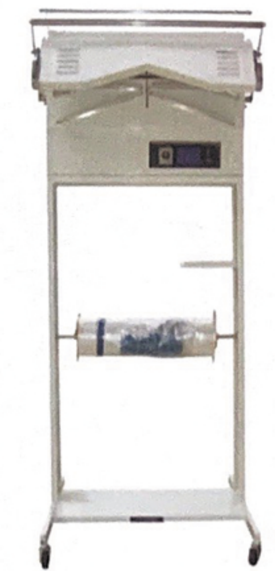
服装包装机 Clothes packing machine