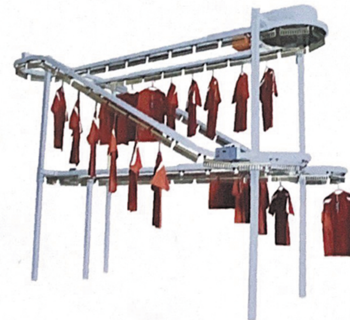
衣物输送线 Clothes conveyor line