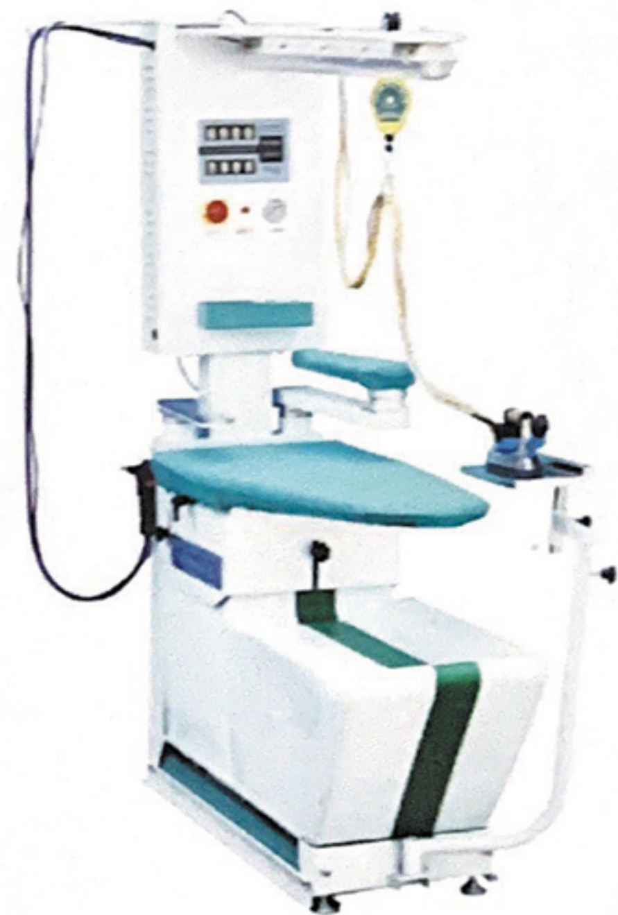
多功能豪华吸鼓风烫台 AW Series Multi-functional luxury blast ironing table